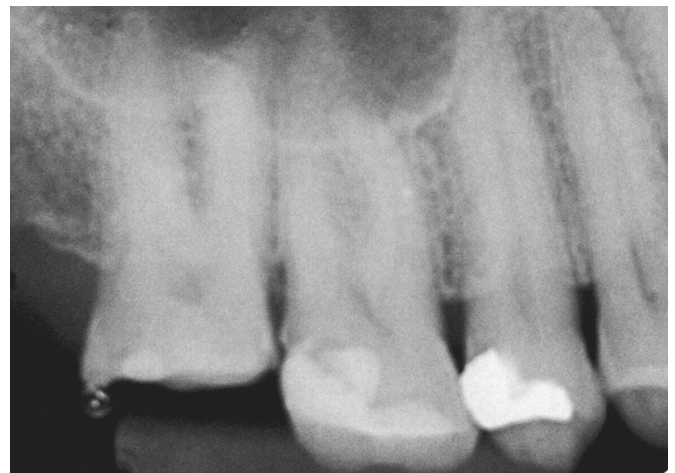
Figure 1. Initial radiograph showing extensive temporary restoration of tooth #17 and no periapical radiolucency.

After anesthesia with 2% lidocaine with epinephrine 1:100.000 (DFL, Rio de Janeiro, Brazil), the temporary restoration was removed with a diamond bur (1013, KG Sorensen Barueri, Brazil) and access cavity was performed under rubber dam isolation. 2.5% sodium hypochlorite was used as an auxiliary chemical substance to irrigate the root canals during cleaning and shaping. An endodontic probe DG16 was used to explore the pulp chamber floor, allowing identification of the mesiobuccal root