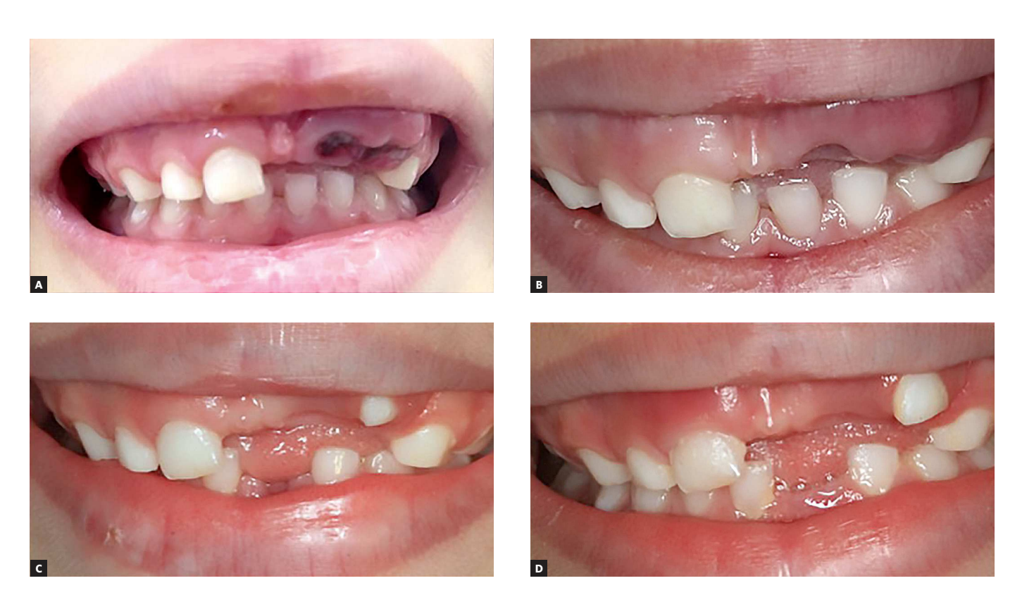
Figure 1. A) First session intraoral examination revealing absence of teeth #61 and #62 with swelling and redness in this region. B) After one week, swelling in the upper lip and the gingival region of teeth #61 and #62 subsided with healing of laceration. C) After 30 days, there was spontaneous eruption of tooth #62. D) After four months, tooth #62 had erupted buccally without changes of color and fistula.