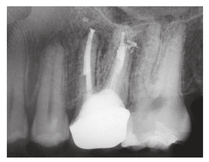
Figure 20. Control radiograph 36 months after treatment onset. Note periapical bone repair.