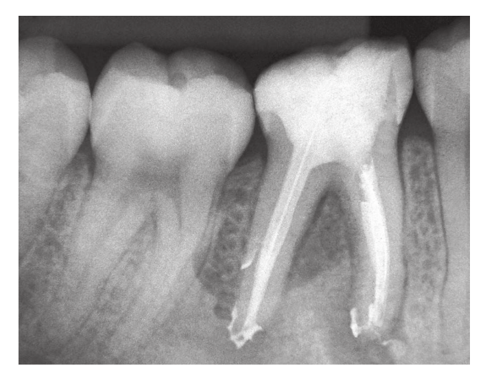
Figure 9. Final periapical radiograph. Note adequate endodontic treatment, satisfactory fiberglass post fitting and excellent sealing of final restoration material.