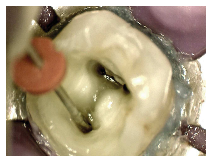
Figure 3. Gates-Glidden II bur (Dentsply-Maillefer, Ballaigues, Switzerland) performing initial root canal preparation for fiberglass post placement.