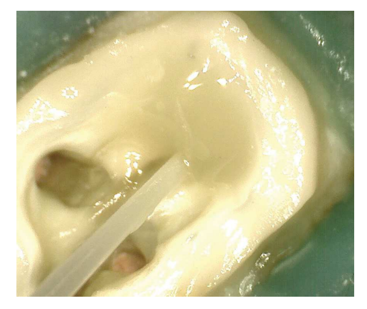
Figure 15. Sonic activation of resin cement with the aid of EndoActivator apparatus (Dentsply Tulsa Dental Specialities, Tulsa, OK, USA).