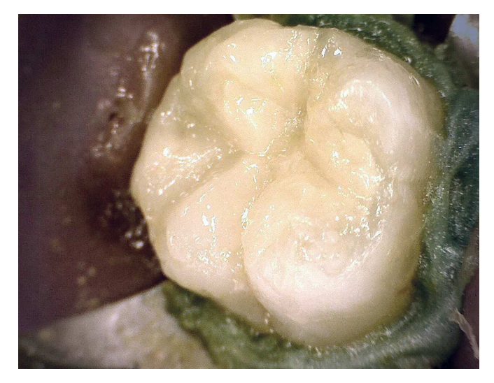
Figure 8. Final restoration in composite resin (Opallis, FGM, Joinville – SC, Brazil).