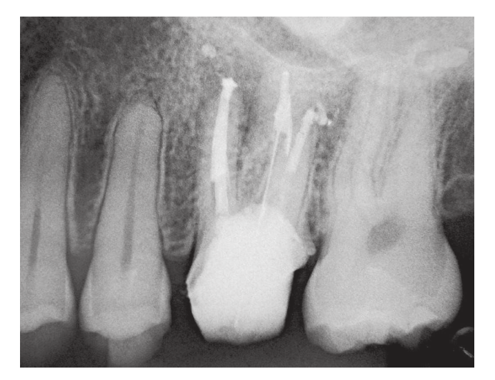
Figure 19. Final periapical radiograph. Note adequate endodontic treatment, satisfactory fiberglass post fitting and excellent crown sealing.