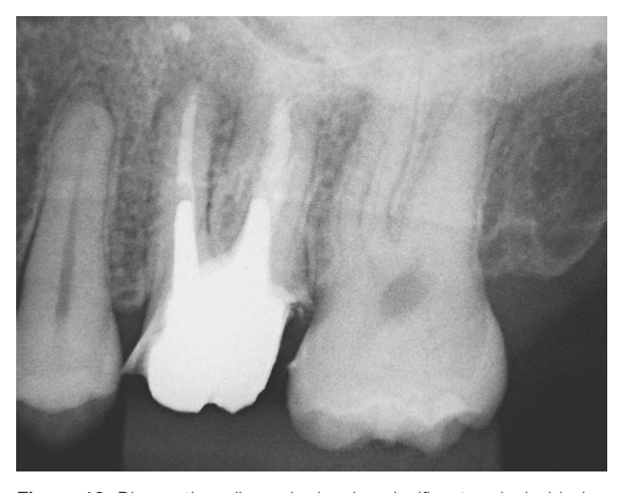
Figure 12. Diagnostic radiograph showing significant periapical lesion in the mesial root.