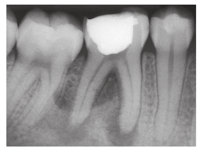
Figure 1. Diagnostic radiograph revealing significant periapical lesion.

The 24-month radiographic control revealed the periapical lesion was repaired (Fig 10), the patient was asymptomatic and the tooth correctly restored.