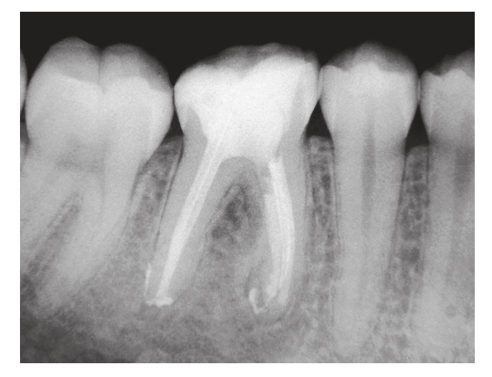
Figure 10. Control radiograph 24 months after treatment onset. Note periapical bone repair.