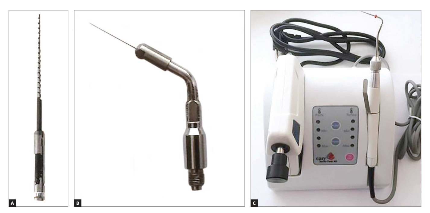
Figure 2. Devices used in the three experimental groups: McSpadden<sup>™</sup> compactor (A), bidigital B spreader intermediate component coupled to ENDO L ultrasonic insert (B), and Term Pack WL<sup>™</sup> (C).

Root canals in which McSpadden<sup>™</sup> compactor (group 1) was used, the following protocol was applied: after placement of the fifth accessory point, gutta-percha cones were plasticized with the aid of