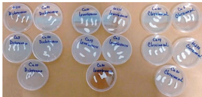
Figure 3. Petri dishes demonstrating the paper cones in direct contact with the different pastes.

A) Ca(OH) 2 +propylene glycol; B) Ca(OH) 2 +2% chlorhexidine; C) Ca(OH) 2 +clotrimazol; D) Ca(OH) 2 + ketoconazol; E) Ca(OH) 2 +fluconazol; F) Ca(OH) 2 +itraconazole; G) Ca(OH) 2 +levofloxacin; H) Ca(OH) 2 +amoxicillin; I) Ca(OH) 2 +triple antibiotic powder (200 mg ciprofloxacin + 500 mg metronidazole + 100 mg minocycline); J) Ca(OH) 2 +ibuprofen; K) Ca(OH) 2 +sodium diclofenac.