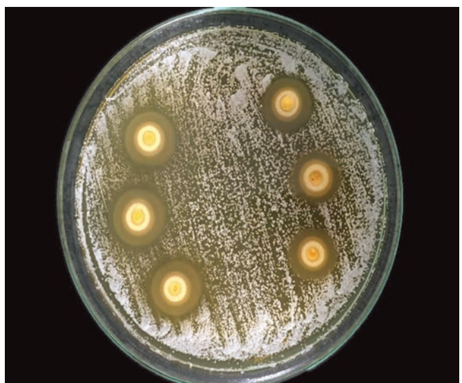
Figure 1. Agar Diffusion Test

To evaluate the antifungal activity of the \text{CaOH}_2 pastes studied, the radial diffusion technique was used on the surface of Sabouraud dextrose agar discs (Merck®) 17 (Fig 1).