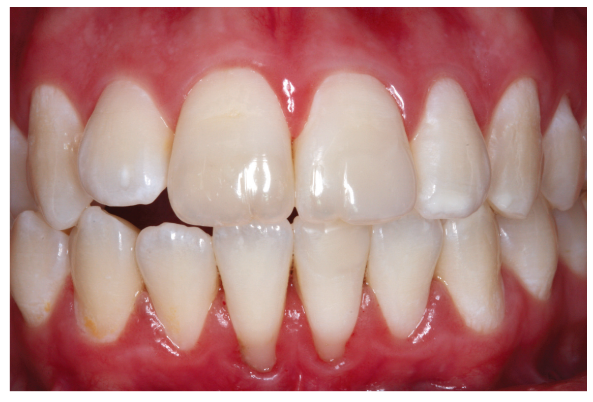
\textbf{Figure 7:} \ Immediate \ final \ clinical \ condition \ after \ finishing \ and \ polishing \ of \ the \ restorations, \ frontal \ view.