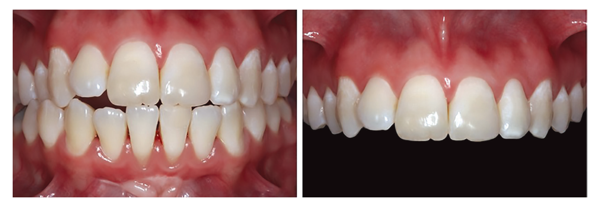
Figure 8: Final clinical condition, frontal view and after 4 years of proservation.