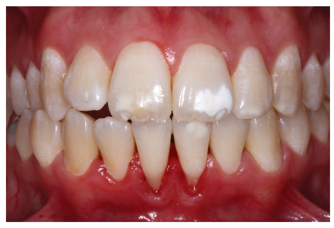
Figure 1: Initial clinical condition, frontal view in occlusion.

In order to evaluate the extent and opacity degree of the enamel spots and to assist in the treatment planning, the light emitting tip of a photo curing device based on a halogen lamp was placed on the palatal surface of the incisors (Fig 2).