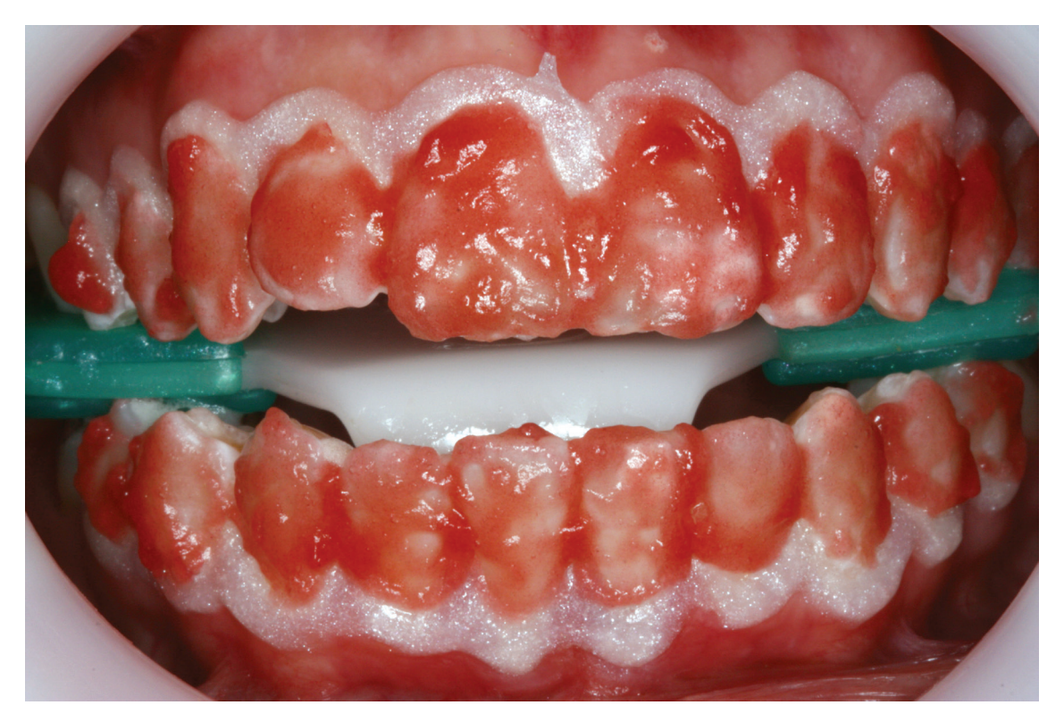
Figure 3: 38% hydrogen peroxide bleaching gel application.

tongue and expose dental arches (ArcFlex, FGM Dental Products). As a safety measure, the eyes of the operator, assistant and patient were protected with glasses (Uvex 140MM, USA). The marginal gingival tissue and the cervical region of the teeth were also protected with a photopolymerizable resin (OpalDam, Ultradent Products Inc.). The bleaching gel remained on the vestibular surface of the teeth for 30 minutes (Fig 3), uninterruptedly, when it was then removed with the aid of a disposable suction device. The teeth were then washed with a water jet, applied in the cervico-incisal direction, and the gingival protection was removed with a double exploratory probe number 5 (Duflex SS White).