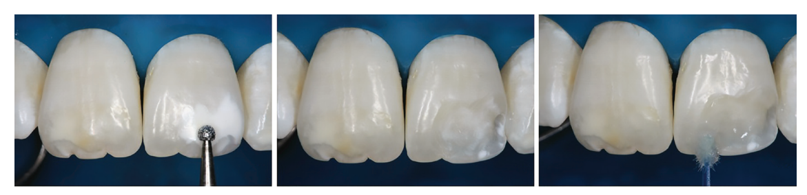
Figure 4: Mechanical removal of stain and hydration for clinical evaluation of the remaining substrate.

After preparation, the enamel and dentin substrates were conditioned with 37% phosphoric acid (Condac, FGM Dental Products) for 30 and 15 seconds, respectively. The conditioner was removed with water jet (Fig 5A) and the area was air-jet dried. Then, the Adper Single Bond adhesive system (3M ESPE) (Fig 5B) was applied and photopolymerized with a halogen lamp unit (Ultralux, Dabi Atlante), with a power of 600mW/cm², for 10 seconds.