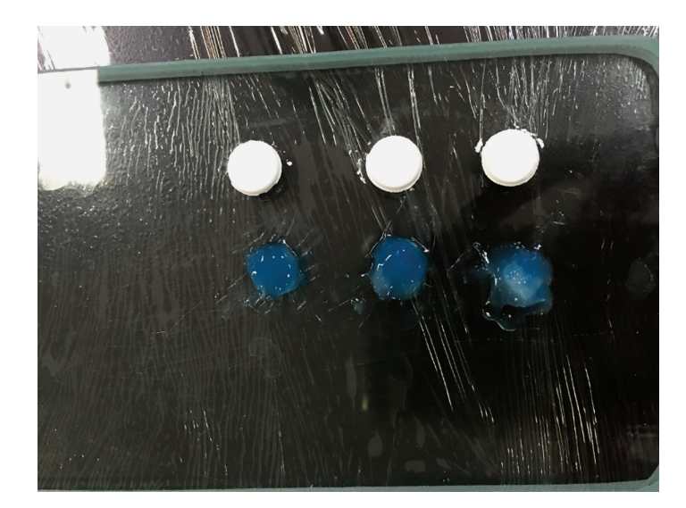
Figure 2: Showing the proportions of phosphoric acid and pumice for use in paste in microabrasion.