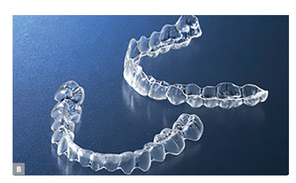
Figure 7: A) Whitening Dental Total Blanc Home C 16 % (DFL) and B) acetate board for home whitening.