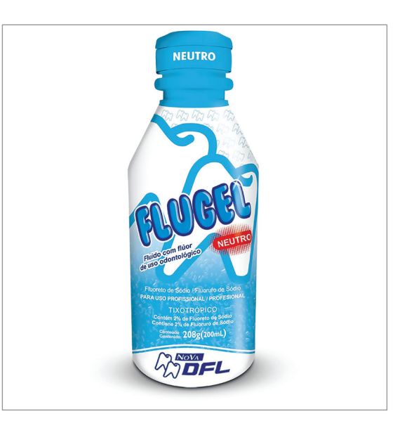
Figure 8: 2% Sodium fluoride (Fluoride gel Flugel, Nova DFL).