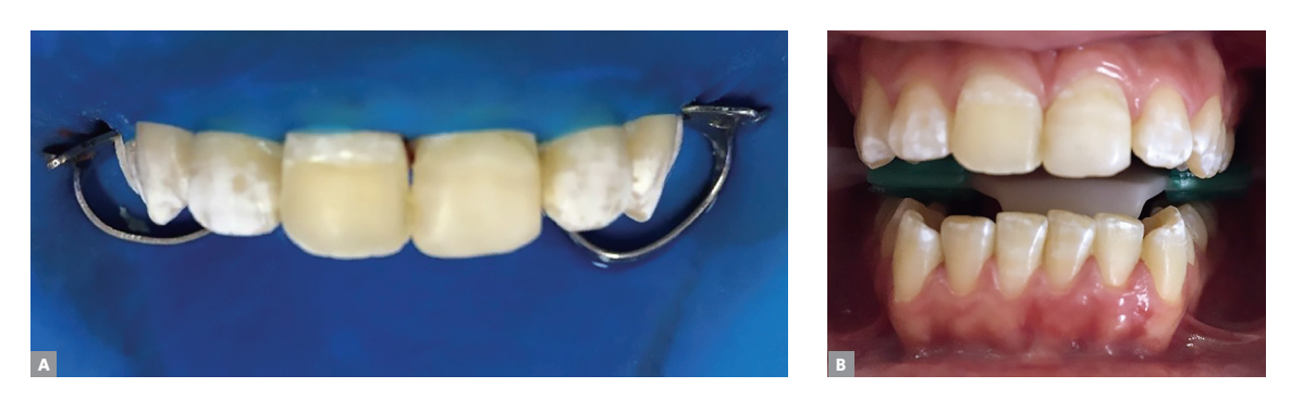
Figure 1: A) Initial aspect of fluorosis patient with isolated operating field. B) Initial aspect of the patient fluorosis.