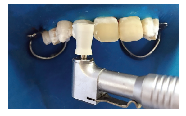
Figure 3: Application of pumice paste and 37% phosphoric acid.