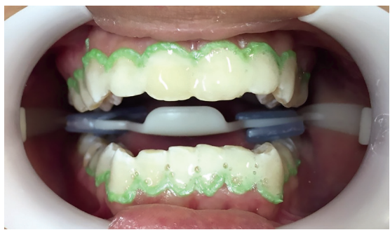
Figure 6: Application of the whitening office agent.