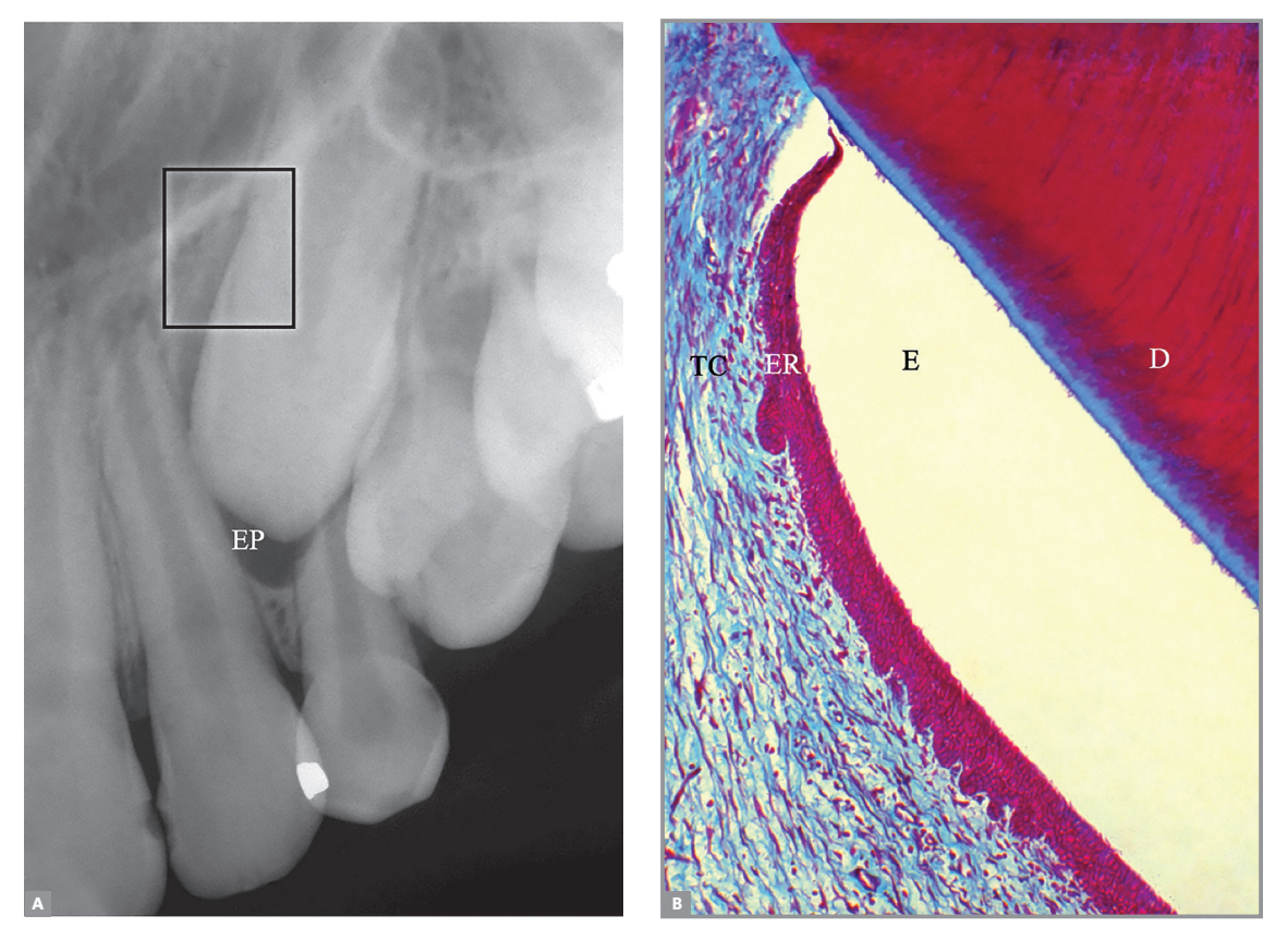
Figure 2: Maxillary canine only "apparently" touches the lateral incisor. Imaging examination taken with different X-ray beam angles as well as tomographic scans will reveal a gap between crown and root. Every crown is coated by follicle found in the pericoronal space as revealed by imaging examination. In B , note reduced enamel epithelium adhered to the enamel and supported by fibrous connective tissue. This is what comprises most part of the follicular structure. E = enamel; D = dentin; RE = reduced enamel epithelium; CT = connective tissue; PS = pericoronal space. (TM, 100X).

Cells resorbing mineralized tissues, including cartilage, can merely be referred to as clasts, as they represent the same cell of the same macrophage lineage coming from the bone marrow. Clasts might have only one nucleus, but they are usually multinucleated, with an average of 10 to 15 nuclei<sup>3,4</sup> (Fig 4). Morphologically, as revealed by a light microscope, clasts can be easily identified; however, researchers use immunocyto-