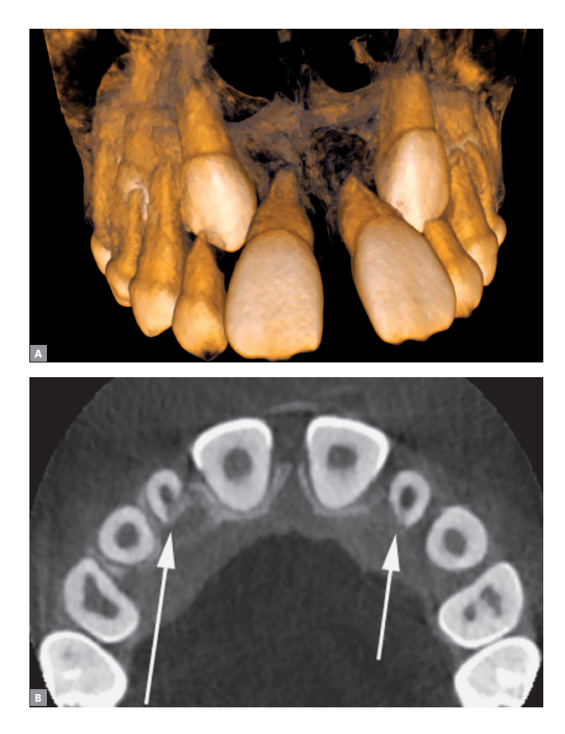
Figure 3: Tomographic scans obtained in slices or 3D reconstructions allow for clear view of a gap between mineralized structures of teeth, although some slices or reconstruction angles might suggest contact between them, as in A . In B , transverse slice reveals induced resorption in lateral incisors (arrow), but with not contact between teeth. Teeth do not cause resorption of other teeth, but clasts aligned in fibrous connective tissue found between them do.

On unerupted tooth crown surface reduced epithelium is adhered to enamel (Fig 2). In fibrous connective tissue providing support to the ep-