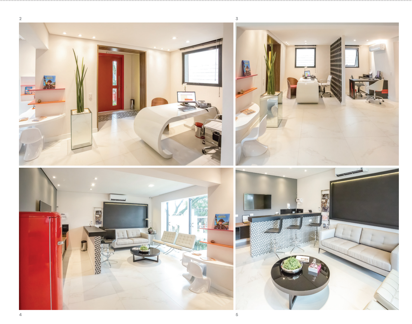
Figure 2 to 5:

Outstanding features: red entrance door and integration of spaces.