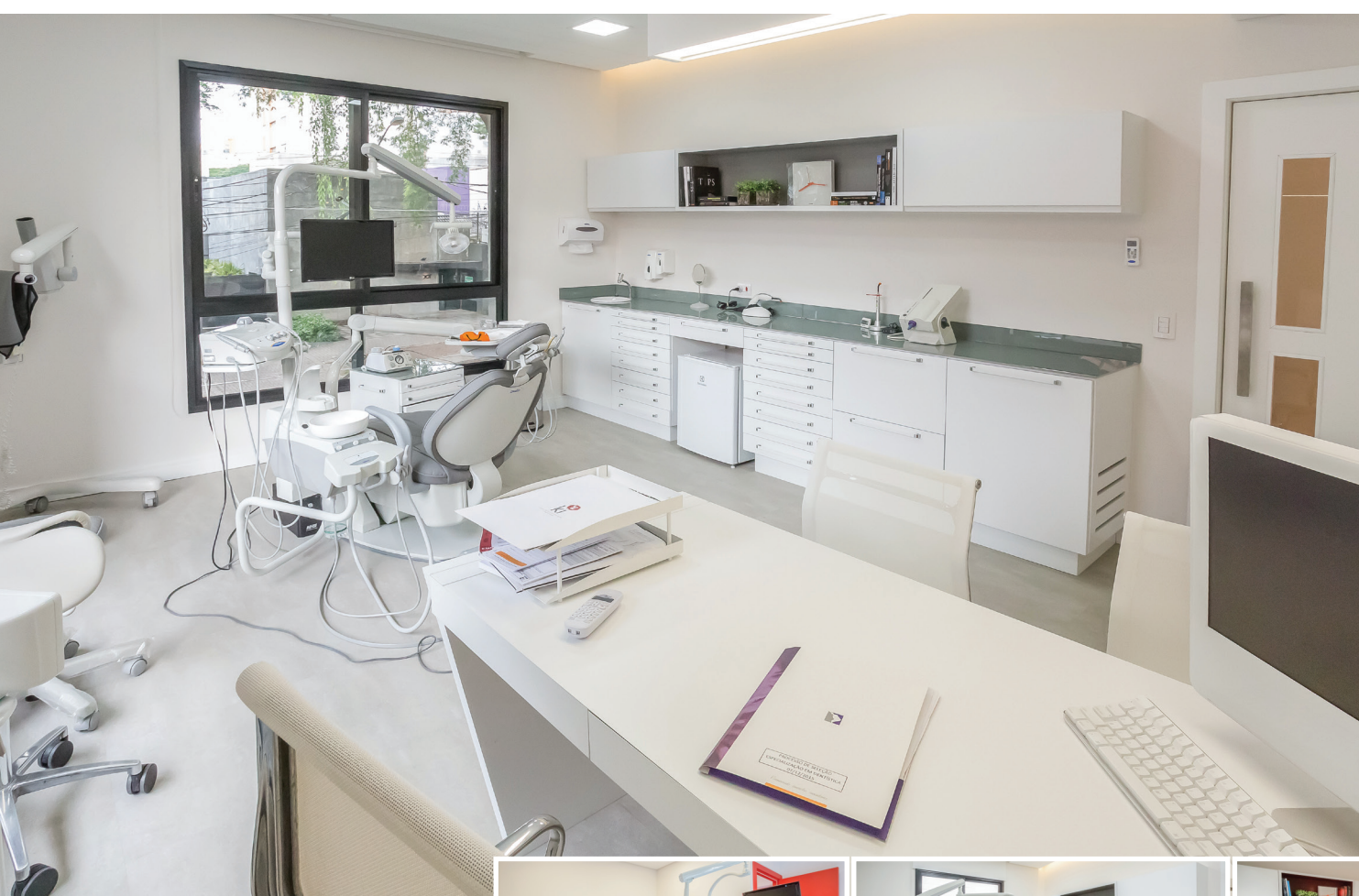
Figure 6 to 9:

The four independent offices are independent and have chairs of different colors, which are also used in cabinets, to make their identification easier. Color of mobile pieces of furniture is neutral, as they may be rolled out to different offices.