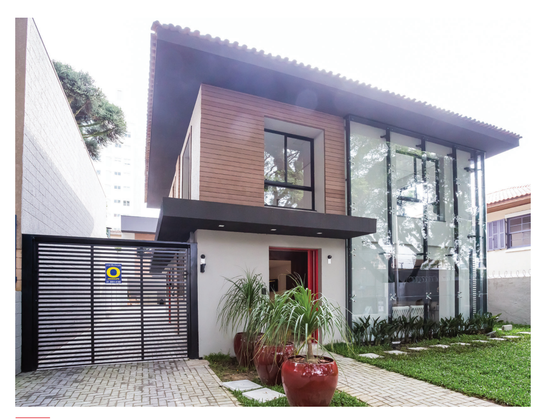
Figure 1: Front façade, where windows stand out.