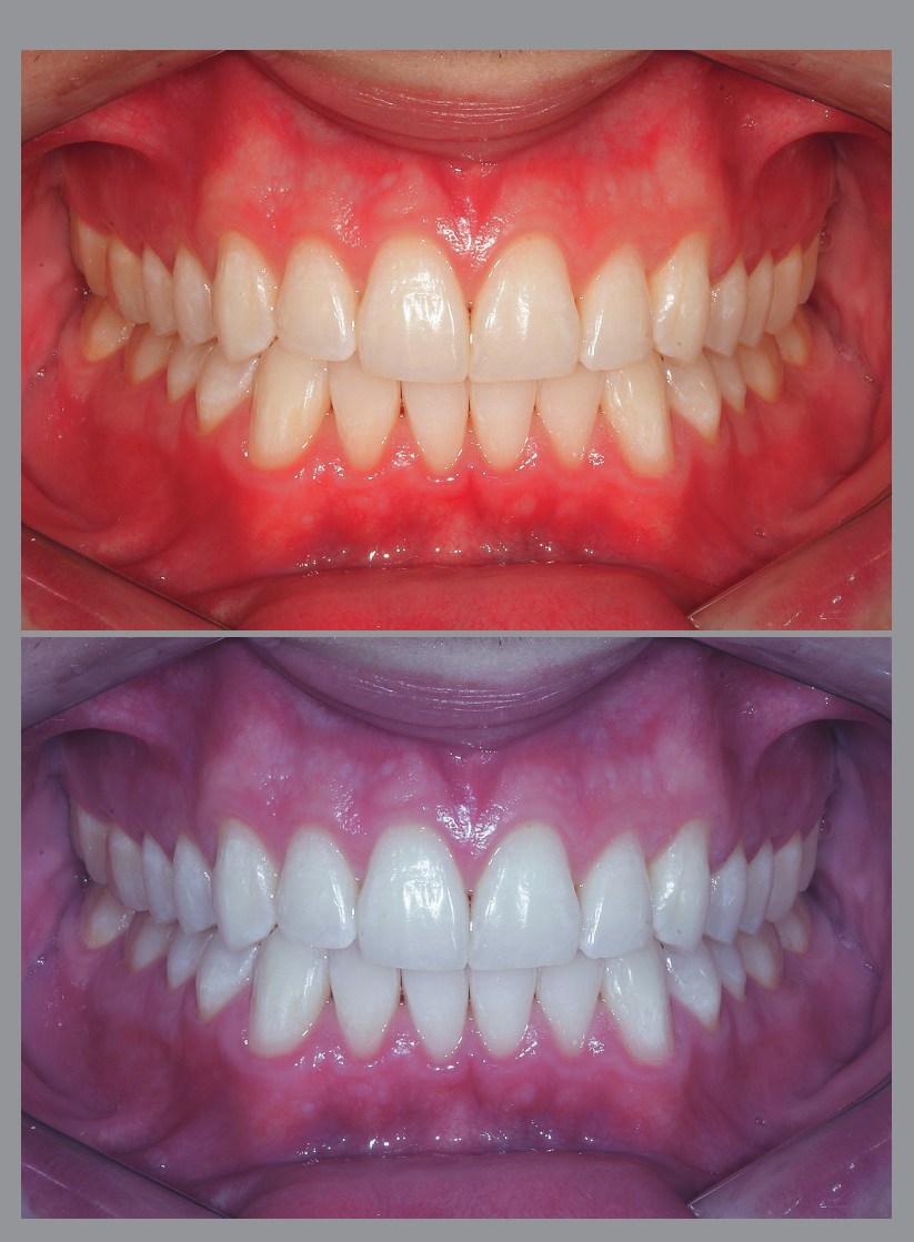
Figure 3: Frontal intraoral photographs with the same smartphone, standardizing the distance and positioning of the smartphone, but changing the color, which produces images that are not desired for clinical photography.