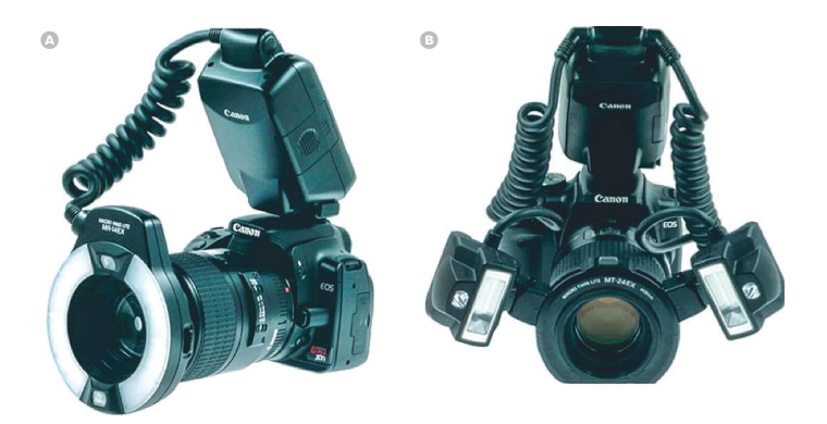
↑ Figure 4: Camera, lens and circular flash (A) or twin flash (B) set.