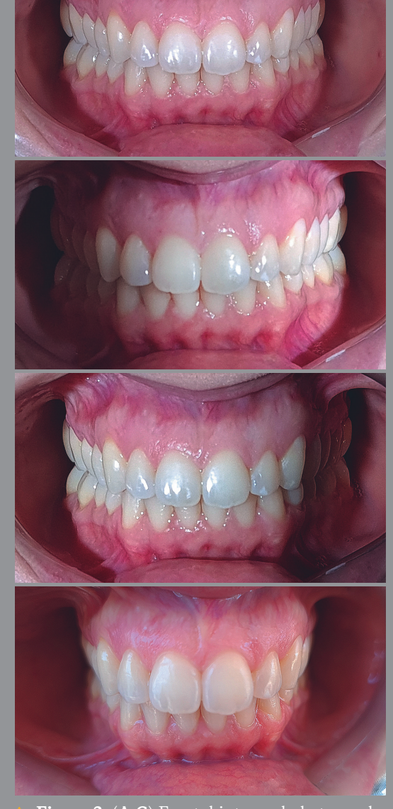
Figure 2: (A-C) Frontal intraoral photographs with the same smartphone, standardizing the distance and positioning, but changing the light direction, which produces images that are not desired for clinical photography. (D) Frontal intraoral photograph, positioning the smartphone very close to the patient, causing some image warp, known as barrel distortion.